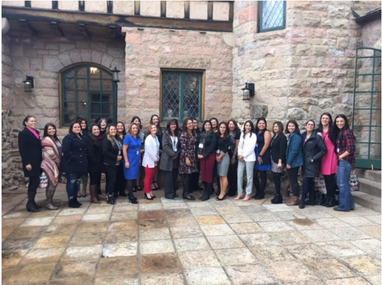
Latina Leaders gather outside the Cherokee Ranch and Castle

With a nearly sold out event, The Colorado Association of Latino/a Administrators and Superintendents hosted the 2 nd Annual Latina Leadership Conference on Nov 3, at the beautiful Cherokee Ranch & Castle located in Sadalia, Colorado. The theme this year of “Our Search For Identity, Community, Purpose” sparks a launching point for further conversation within the organization to support aspiring and current Latina administrators and educational leaders.